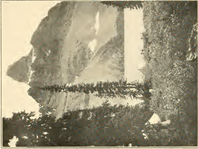
CAMP AT NASHAN-ESEN LAKE AT THOMPSON PASS.